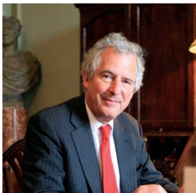
Rt Hon Lord Waldegrave of North Hill