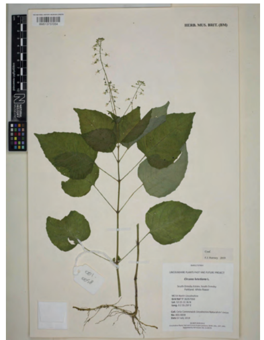
Example of a herbarium specimen Circaea lutetiana Enchanter's Nightshade