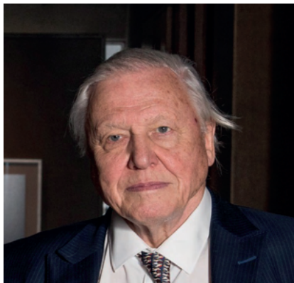
Sir David Attenborough OM

The Society is fortunate in having the support of two Patrons who are well known in the field of natural sciences and studies of Sir Joseph Banks. Baron Waldegrave of North Hill is a former Cabinet Minister and is now Provost of Eton College. Sir David Attenborough is well known for his natural history broadcasts and was formerly Controller of BBC2 television.